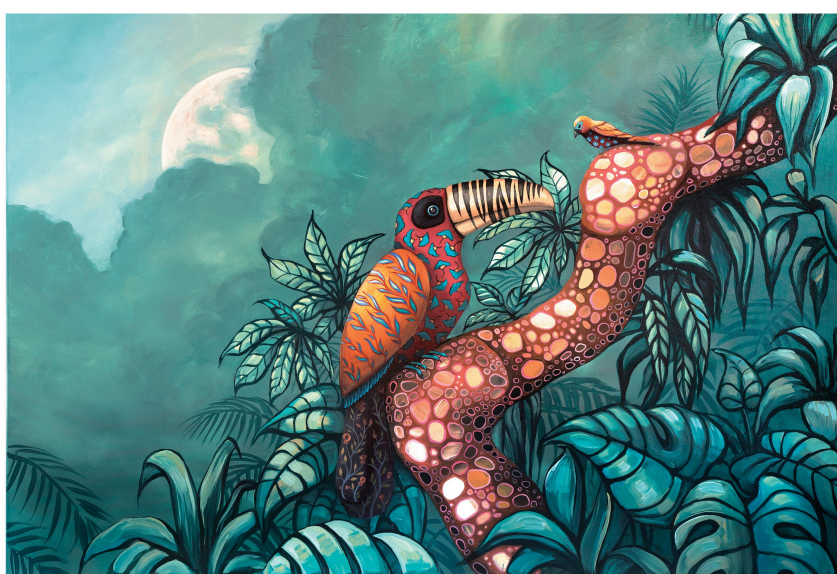
15/50 "THE JUNGLE GROWING IN MY HEART" INGRID NUSS '14